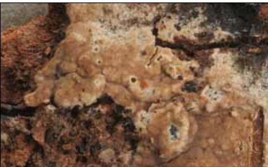
Tomentella caerulea .

This anthology of the mycological literature represents a collection of articles focusing on fruitbodies – how do the fungi form them, why are some big, and some small, and why are they now in many places not fruiting at the same time as they used to. As always, a personal choice, with too many interesting articles left behind; this is only an inspiration for exploration of the literature that you can find online.