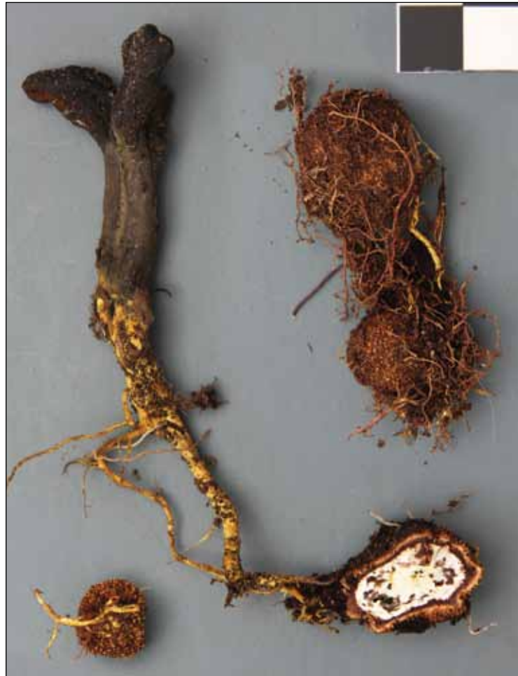
Figure 3. Elaphomyces sp. parasitized by Elaphocordyceps ophioglossoides .

peridium, much like another false truffle genus, Hymenogaster . Fortunately, again the cross section allows us to identify the genus. Hysterangium has an olivaceous gleba (context), not seen with the otherwise dark Hymenogaster . Hysterangium also has a well-developed columella (an apparent central “trunk” from which branches of stroma split into smaller and smaller limbs to fill the inside). The interior is not solid as Hymenogaster , but has some air cells between the branches. Unfortunately