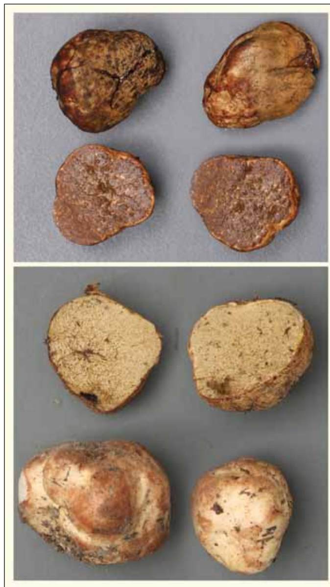
Figure 2. Voucher pictures of Alpova sp., above, and Rhizopogon evadens , below. Again note the obvious global difference between the two genera. These shots taken some hours after collection show that Alpova darkens with time more than Rhizopogon .

Elaphomyces (Figure 3, page 14) is a mycorrhizal partner of conifers, and our only true truffle, although not the prized edible. Its outer shell, the peridium, is hard and thick; inside is a white spore mass that