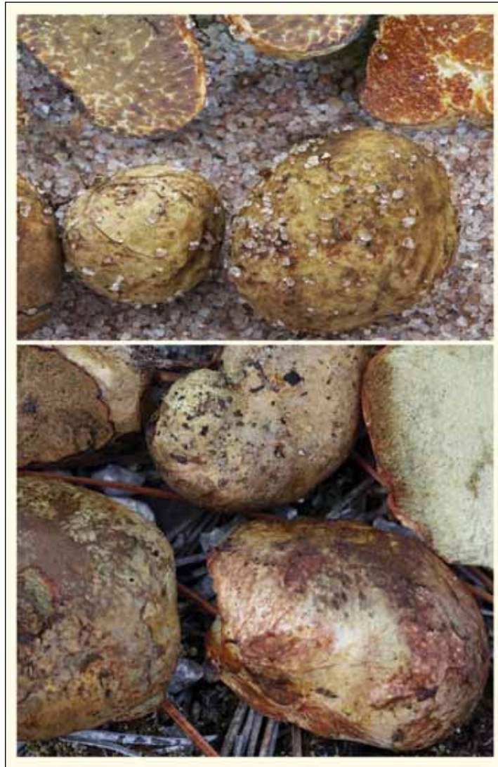
Figure 1. Field pictures of Alpova sp., above, and Rhizopogon pseudoroseolus , below. Quite similar on the outside, the cut surface shows the difference between the genera: a solid marbled gleba for Alpova , and a palisade of air cells for Rhizopogon . There is also a change of color of the cut surface of Alpova , red first, turning a dusky brown with time.

Most truffles are round mushrooms growing beneath the soil surface (hypogeous). The famous and prized edible truffles grow around the Mediterranean and on the west coast of continental North America. They are Ascomycetes, producing spores in elongated sacs like the cup fungi with whom they belong. False truffle is a term reserved for truffles that are not Ascomycetes. Most are Basidiomycetes (primarily mushrooms with cap and stem) that have lost their "normal" shape and gone underground (become hypogeous). Typically, the cap bears and protects the sporulating surface (gills or pores/tubes), and the