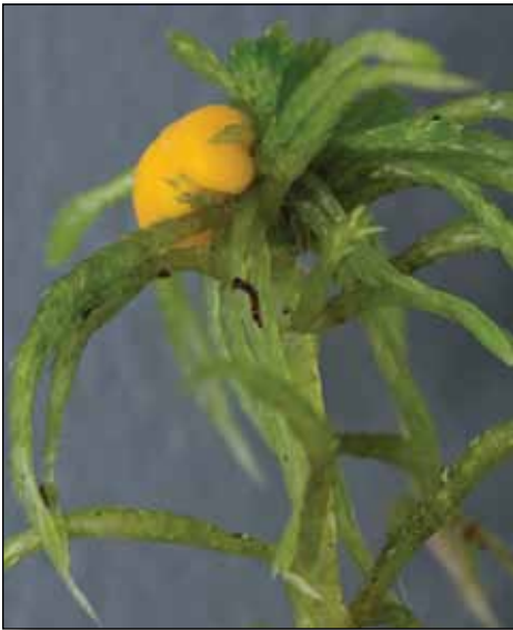
Figure 4. Endogone pisiformis fruiting in its characteristic location on top of Sphagnum . Greatest diameter 3.5 mm.