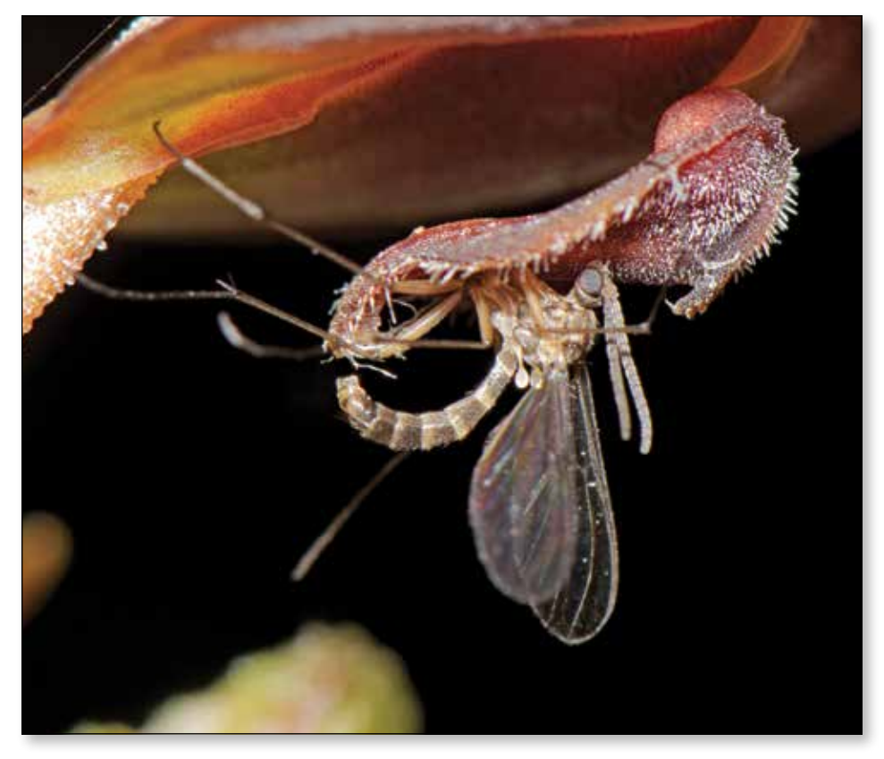
Male Mycomya species (Mycetophilidae) on labellum of Pterostylis sanguinea in pseudocopulation position.