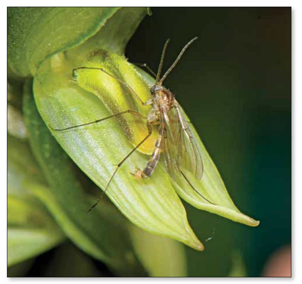
Pterostylis smaragdyna , with Mycomya sp. male (Mycetophilidae), on labellum.

rituals distracted Rhea's baby-eating husband, Kronos, from her last offspring, the infant Zeus (Bernhardt, 2008). Every winter, following rain, 33 species of helmet orchids appear in Australian woodlands and in jungle gullies. They are easy to miss as the flowers open almost flush with the humus and their petals and sepals are dark in color. Some naturalists would insist they are the most mushroom-like of all orchids. The dorsal sepal forms a smooth, cap-like dome over the column. The lip petal differs in outline from species to species. Sometimes its margins are beautifully scalloped and ribbed like mushroom gills. The center of the lip, when visible, features a raised, smooth, often whitish surface known as the boss.