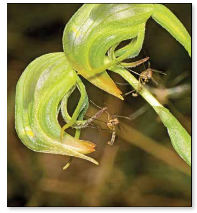
Nodding Greenhood Pterostylis nutans with male Mycomya (Mycetophilidae) fungus gnats on labella.

each other, releasing a compound "lump" known as a pollinium. Depending on the orchid species, the solitary anther in most orchid flowers releases from two to eight pollen wads (pollinia) that ultimately attach themselves to the body of their pollinator by means of a sticky disc or glue drop known as the viscidium. The entire unit is known as a pollinarium. This means that, unlike the flowers in most plant families, the deposition of pollinia on a pollinator's body must be precise and repetitive. It explains why some orchid flowers are so huge compared to their pollinators. The insect must be beguiled, redirected, canalized, and corralled before it can leave the flower wearing pollinia restricted specifically to its tongue, or head, or thorax, or abdomen. Thousands of orchid flowers are frauds. Their shapes, colors, and smells look like they are offering good food or a sexual partner, but it's a lie. Depending on the orchid species, butterflies, moths, wasps, bees, and large flies are duped ... and so are some fungus gnats (Edens-Meier and Bernhardt, 2014).