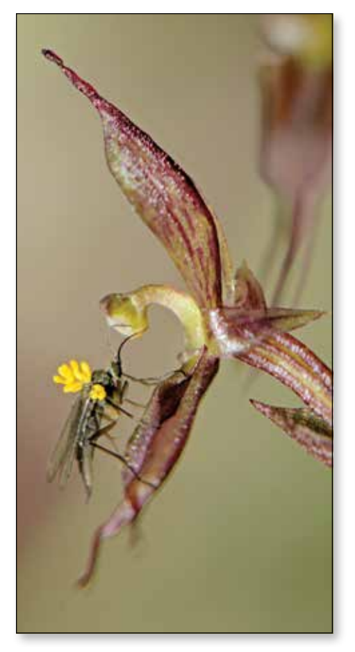
Female sciarid species with numerous pollinia on Acianthus pusillus .

must be considered in terms of real estate. It's all location, location, location. As more scientists study the ecology of fungus gnats, and the plants that need them, they note that natural selection favors flora with flowers modified to attract pollinators preferring gloomy and damp environments. Bees, butterflies, day moths and most nectar-feeding birds are sun lovers and may avoid flowers standing in shade much of the day. Readers with access to deciduous forests may have noticed that bumblebees stop visiting the spring flowers of the forest floor after the canopy leafs out. Some of the most efficient bees avoid nesting in wet sites as the wax that makes up their brood cells absorbs water vapor. Therefore, tropical forests at higher elevations receiving clouds and mist baths twice a day may be inhospitable to most bees. Then there are the wildflowers and shrubs living in gaps in conifer forests where tall pines and firs keep their needles all year long throwing long shadows. While these aren't the greatest places for bees and butterflies,