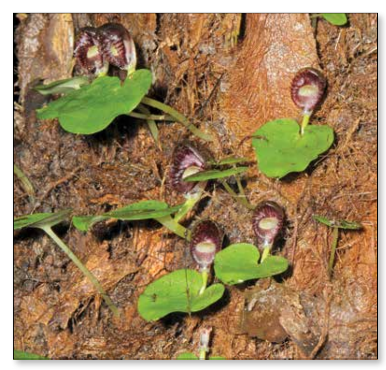
Helmet orchids, Corybas diemenicus.