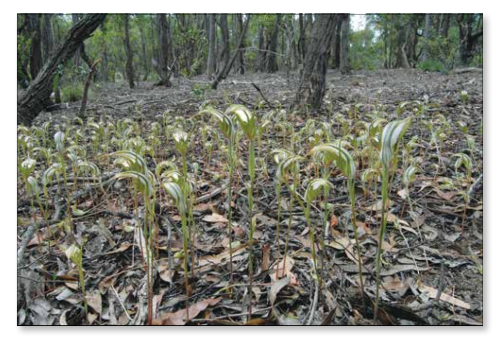
Pterostylis revoluta are single flowered species which may form extensive colonies.

(Mycetophilidae). When the smaller, skinny males drink nectar at the base of the lip petal they literally get down on their knees. The back of their thoraces are now too low to reach the glue gun in the column. Once again, only the bigger females are likely to bonk the column on their way out of the gnat orchid's flower (Kuiter and Findlater-Smith, 2017). Although female gnats are the dominant pollinators in these orchids no one has found eggs in the flowers to date.