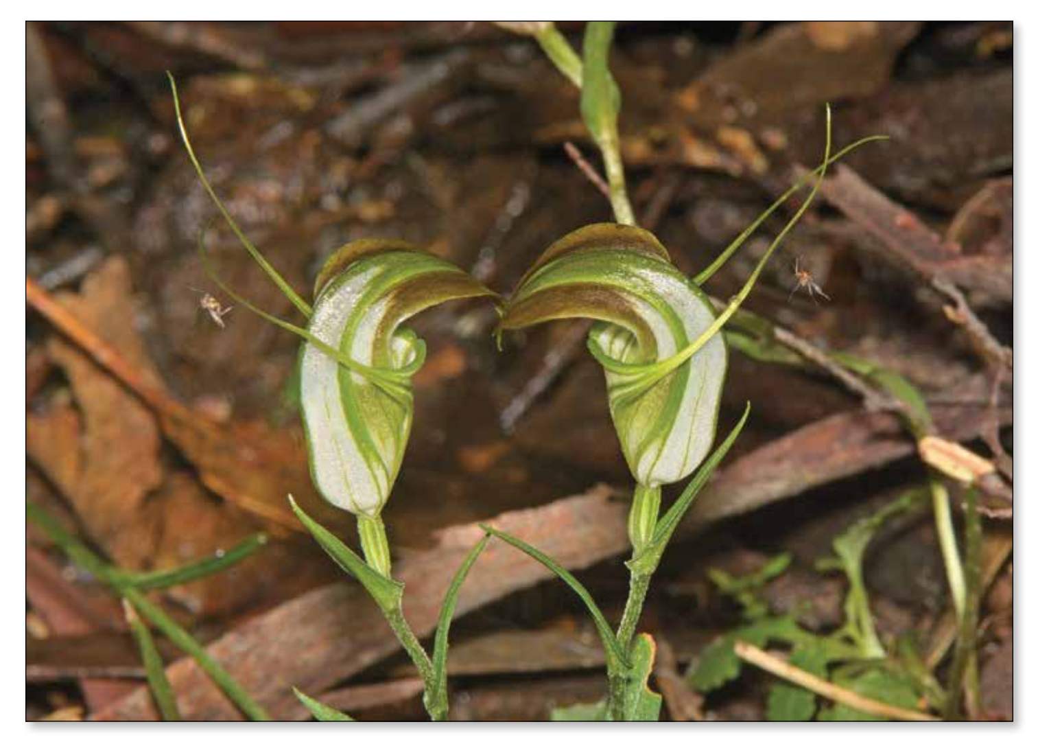
Two tiny pollinator fungus gnats Mycetophila sp., looking minute next to flowers of Pterostylis grandiflora.

shallow soil, activated by winter showers. It's not unlike looking for mushrooms. The closest we have to an epiphyte that may entice fungus gnats is the mountain helmet orchid ( Corybas grumulus ). Sometimes it is found growing on the trunks of tree ferns.