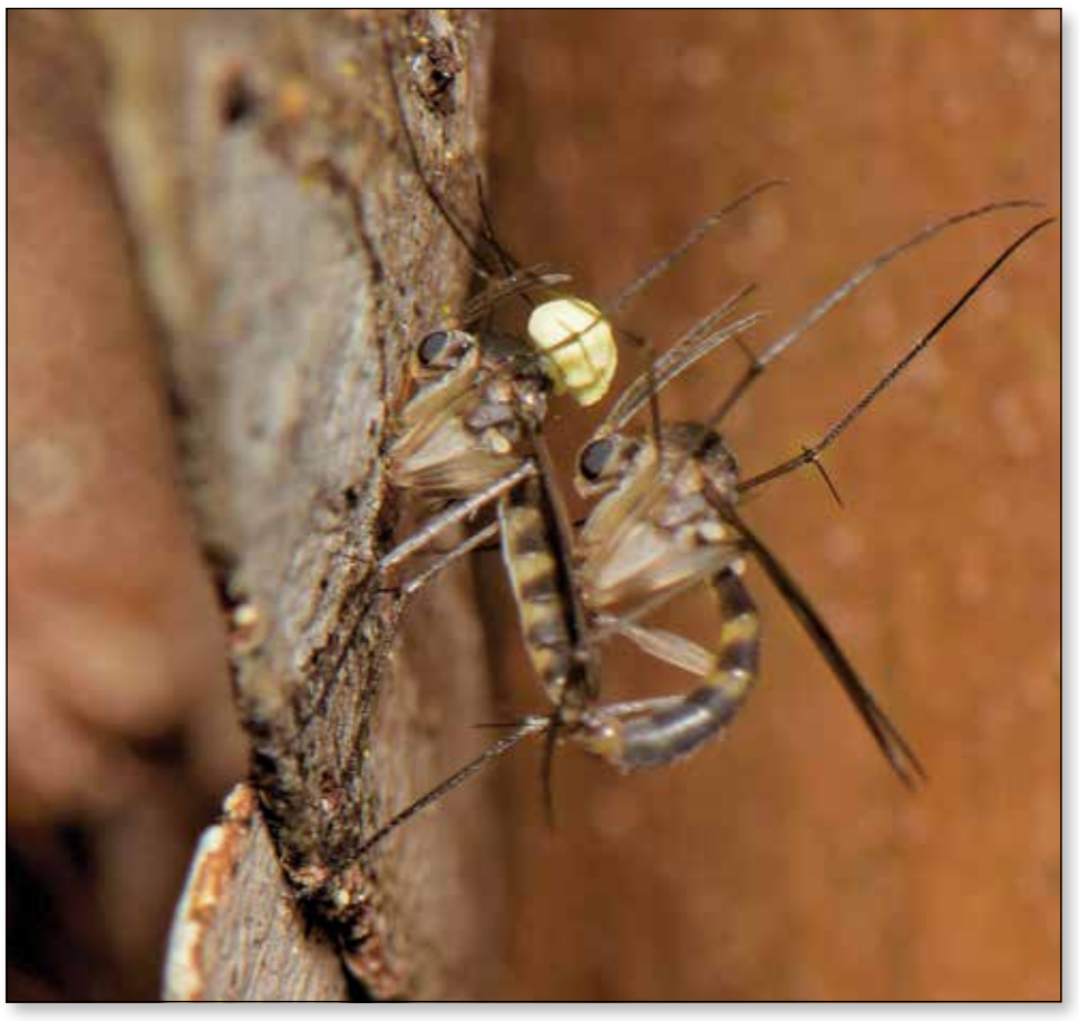
Copulating pair of Phthinia sp. (Mycetophilidae); female with pollinarium of Corybas diemenicus .

must be considered in terms of real estate. It's all location, location, location. As more scientists study the ecology of fungus gnats, and the plants that need them, they note that natural selection favors flora with flowers modified to attract pollinators preferring gloomy and damp environments. Bees, butterflies, day moths and most nectar-feeding birds are sun lovers and may avoid flowers standing in shade much of the day. Readers with access to deciduous forests may have noticed that bumblebees stop visiting the spring flowers of the forest floor after the canopy leafs out. Some of the most efficient bees avoid nesting in wet sites as the wax that makes up their brood cells absorbs water vapor. Therefore, tropical forests at higher elevations receiving clouds and mist baths twice a day may be inhospitable to most bees. Then there are the wildflowers and shrubs living in gaps in conifer forests where tall pines and firs keep their needles all year long throwing long shadows. While these aren't the greatest places for bees and butterflies,