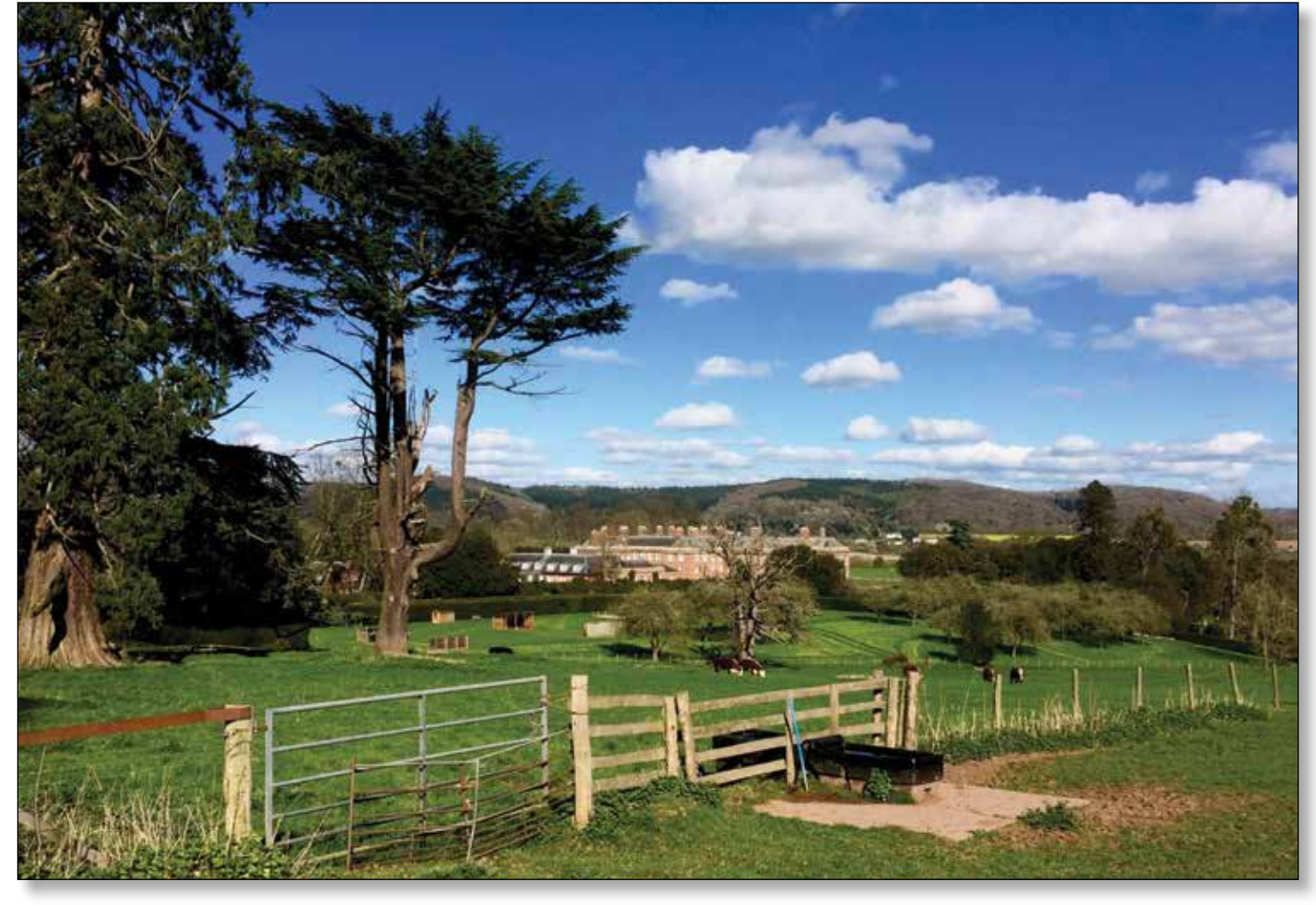
Figure 5. Eastward view from pastures, orchards and original foraging grounds in Holme Lacy Park, with the old manor house and newer hotel buildings in the middle ground, and with wooded hills (and additional first foray hunting grounds near Caplar Camp) lining the horizon immediately east of the River Wye.

Eaters," was not as immense as appears in Smith's cartoon. A contemporary photograph of this sessile oak ( Quercus petraea ) reveals more modest proportions, as might have been guessed. Nonetheless, in 1868 its trunk was recorded in Club Transactions as being 21 feet 10 inches in diameter, with 38-yard spread of foliage, providing ample basis for artistic license.