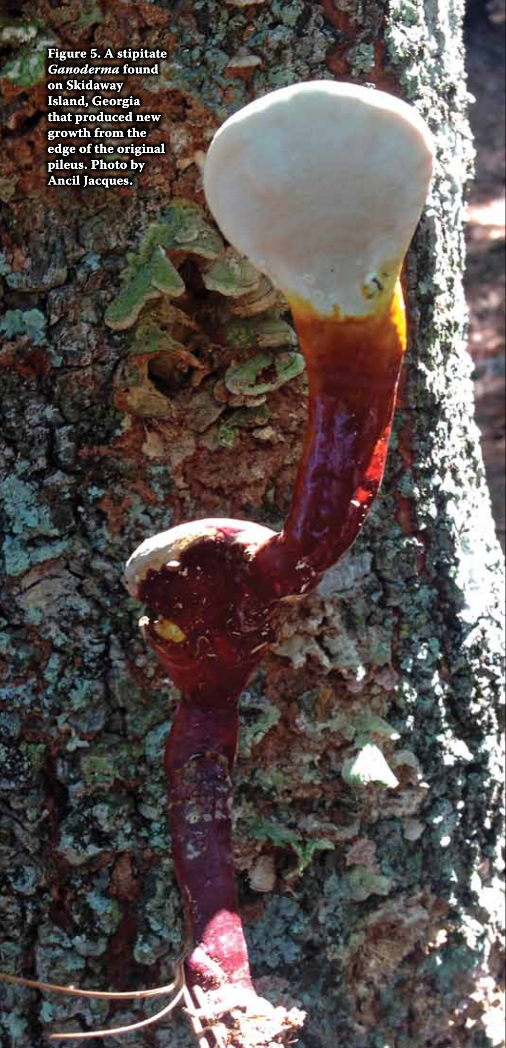
Figure 5. A stipitate Ganoderma found on Skidaway Island, Georgia that produced new growth from the edge of the original pileus.

the edge of the previously formed fruiting body. These new growths were rounded projections and since they were not covered and had plenty of light, they did not elongate into finger-like projections. After finding this specimen, Ancil continued his search for odd looking Ganoderma and a few weeks later had found another along a marsh at Skidaway Island, Georgia (Figure 5). This one showing a slender stipitate fruiting body that produced a second stipitate growth that was much like the first. A mycologist in Mexico, Jesús Pérez-Moreno, also reported that he had found a Ganoderma lucidum ( sensu lato ) with new stipitate fruiting bodies coming out of an old basidiocarp (Figure 6). This was found while collecting fungi in the Limoncocha Biological Reserve in the Ecuadoran Amazon. It was found adjacent to a stream near the Rio Napo that often flooded. All of these collections are great examples showing the ability of Ganoderma to regrow from a previously fully formed pileus. The locations where they were found suggest that an environment with flooding and excessive moisture (and likely high CO 2 concentrations) seems to be a factor to trigger the new fungal growth.