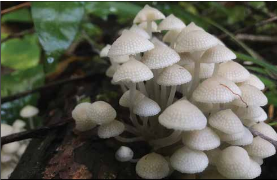
Figure 4. These beautiful clusters of Filoboletus manipularis were photographed near the Buddhist Monastery on Kaua'i.