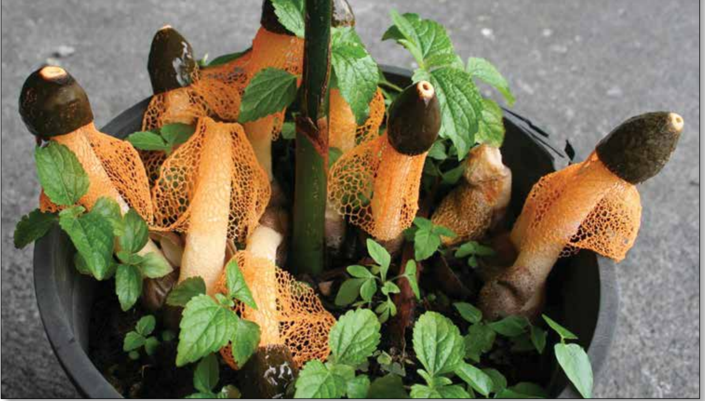
Figure 6. Phallus cinnabarinus invaded a nursery pot at a Hilo garden shop, evidence of how easily these stinkhorns can be spread in mulch and potting material.