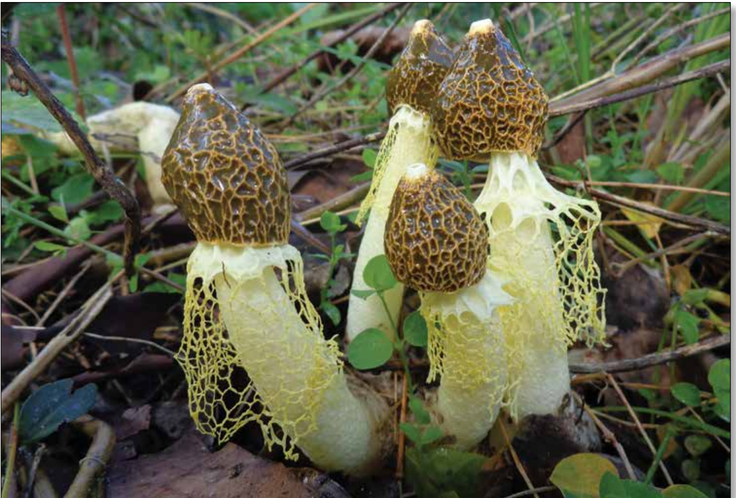
Figure 7. Phallus multicolor is now the dominant species in composted woodchips at the 'Imiloa Astronomy Center on the campus of the University of Hawai'i at Hilo.