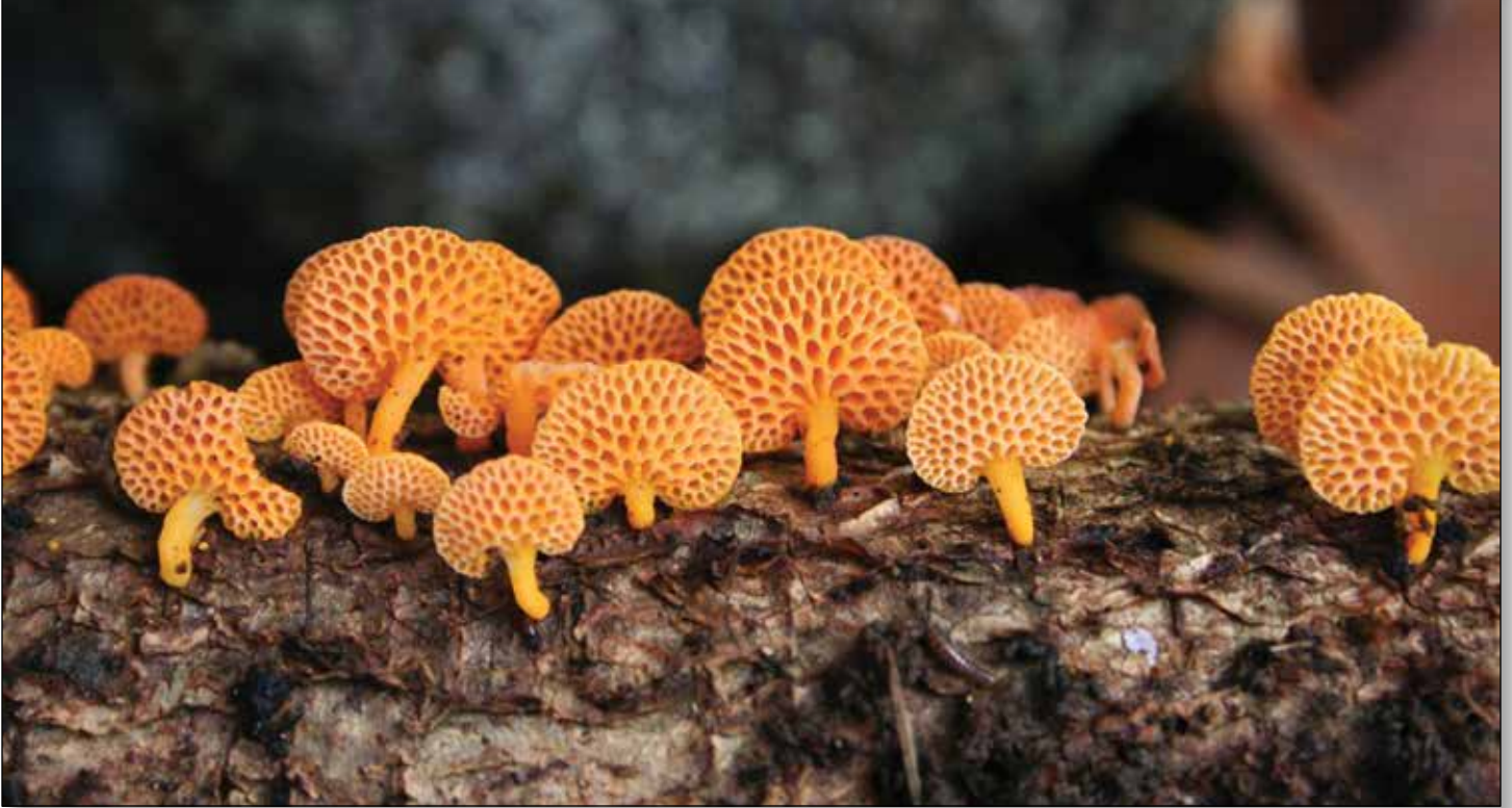
Figure 1. Favolaschia calocera has invaded both native and alien forests in Hawai'i.

Since the publication of the field guide Mushrooms of Hawai'i (Hemmes and Desjardin, 2002) several large, conspicuous mushrooms have been reported for the first time and appear to be spreading across the various islands. They may have been missed or rare in our initial years of canvassing the islands from 1980 until 2002, before the field guide was produced, but now these species are so frequently encountered that it appears they were not overlooked, but are recent arrivals.