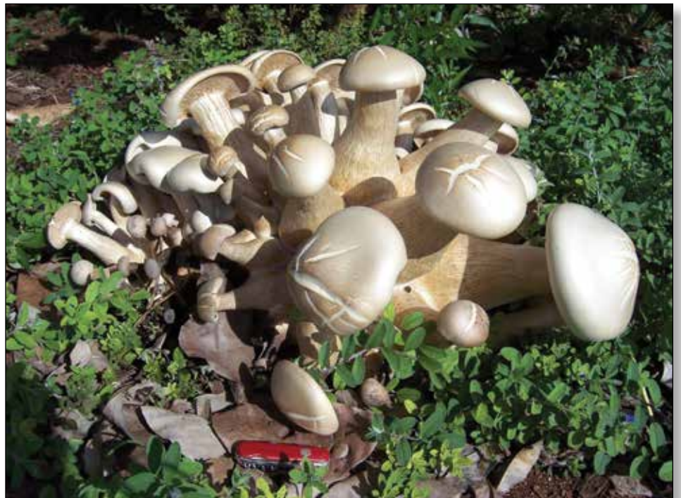
Figure 2. Macrocybe spectabilis has been seen fruiting in the National Tropical Botanical Garden on Kaua'i.

Macrocybe spectabilis (Peerally & Sutra) Pegler & Lodge (Fig. 2) is difficult to miss in the field. Clusters of 30-50 or more fruiting bodies with pilei up to 60 cm in diameter and stipes 40 cm long appear on lawns in parks and in pastures. This species was first recorded from