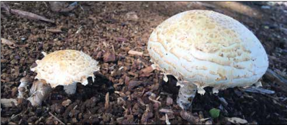
Figure 3. Saproamanita (Amanita) manicata often occurs at Bay Front in Hilo on the Big Island.