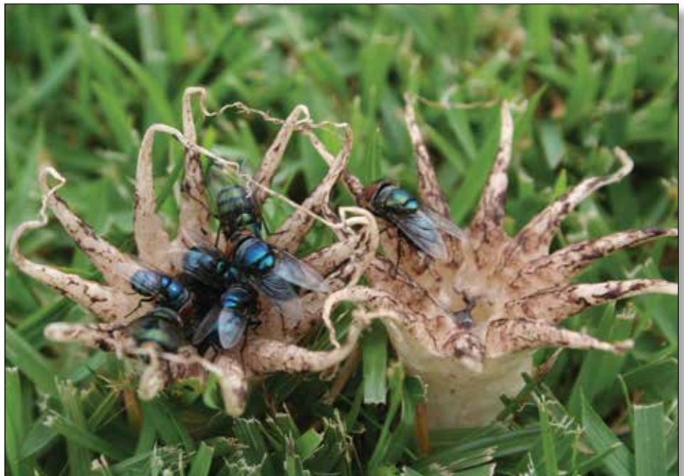
Figure 9. Numerous reports show that Aseroë arachnoidea is spreading to lawns in the newer subdivisions near Hilo on the Big Island.