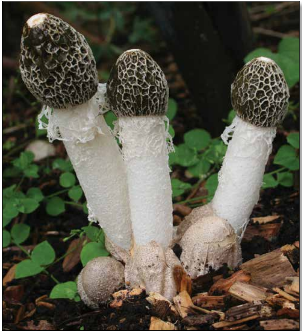
Figure 8. Phallus atrovolvatus , with its pure white indusium and dark volva, appears to be a recent addition to the other two netted stinkhorns found previously on Hawai'i Island.