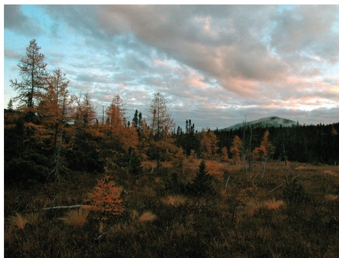
Figure 1. Boreal forest of Gros Morne National Park. Boreal forest, barren mountain and fen readily seen. Some Larix laricina seen silhouetted against sky. Abies balsamea , Picea glauca , and Picea mariana are the most important conifers. Betula papyrifera and Alnus spp. make up the majority of leafy trees.

This lack of similarity in foray censuses from the same region may be explained by the May Model (Voitk, 2006), which postulates that forays typically collect only a very small proportion of the mushroom species in any region at one particular time. Mushrooms collected on forays can be assigned to two groups: a small proportion of common species and a larger proportion of less common and rare species. Most of the common species typically are collected at each foray, while the majority of the uncommon and rare species often are not collected at subsequent forays. Thus, species lists from separate forays can differ so dramatically, that using foray census data is limited, if used to differentiate regions.