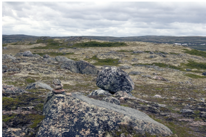
Figure 2. Empetrum barrens of Labrador Straits. Typical heath plants and dwarfed trees. Forests of taller trees only in protected river valleys.

Human beings have lived in the park area for about 4,500 years, and European settlement began around 1800. Today approximately 3,000 people live in the enclave communities. Commercial forestry in what is now the park began around 1900, and lasted until park establishment in 1973. As part of the Federal-Provincial Agreement for the establishment of Gros Morne National Park, the park maintains 12 domestic tree harvest blocks for the use of local residents. Over the years, much of the accessible forest has