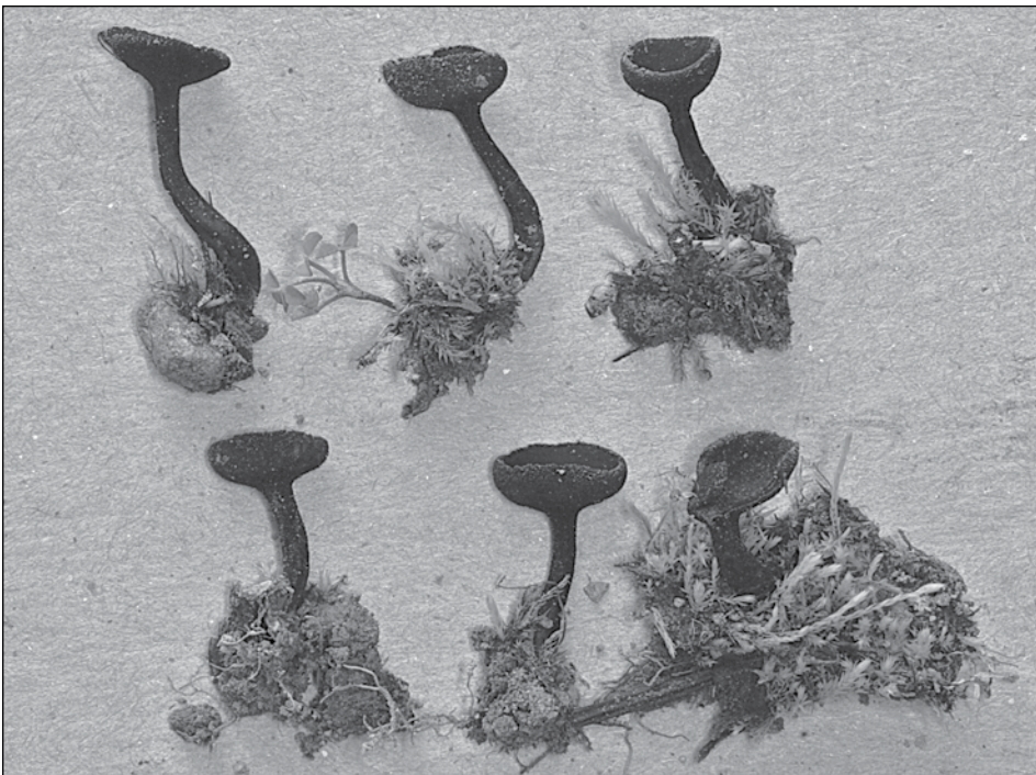
Figure 3. Helvella corium found in the gravel and sand along a roadside, from Vancouver Island, British Columbia.