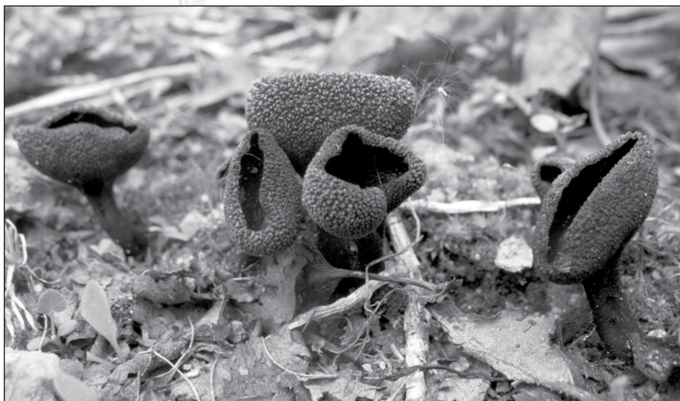
Figures 1a and b. Helvella corium found in the gravel along a woodland roadside near St. Petersburg, Russia.