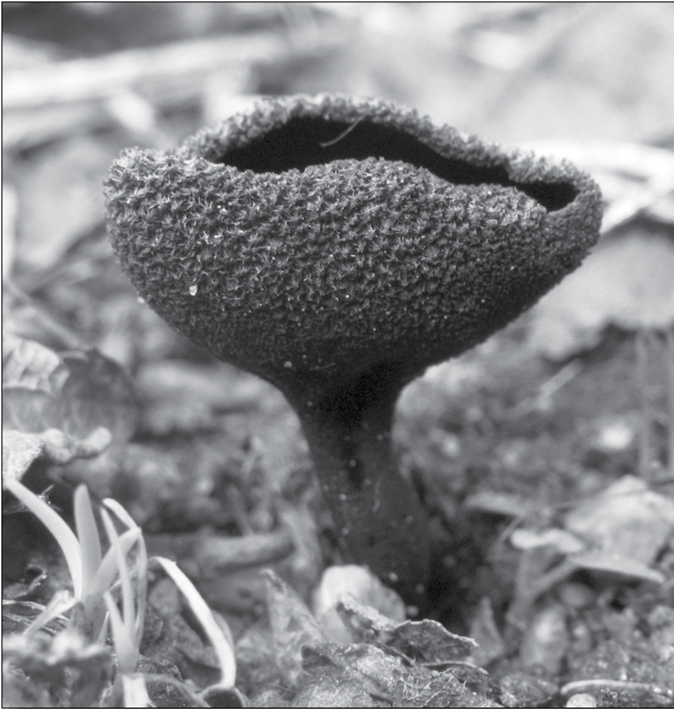
Figure 2. Helvella corium from same population as in Fig. 1. Note the furrowed stem.