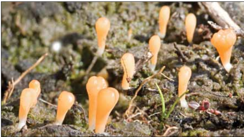
Multiclavula mucida , top, photographed in Central Newfoundland and M. vernalis , bottom, photographed in central Labrador. Note the green scum covering the substrate in both cases, unmistakable but less obvious on the mud of the lower photo.